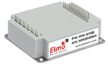
Whistle Intelligent Digital Servo Drive

The Whistle is very compact, measuring just 55 x 46.5 x 15 mm (2.2" x 0.6" x 1.8") and weighing only 50 g (1.8 oz). It has an output of 1.6 kW – 20 A at 80 VDC.