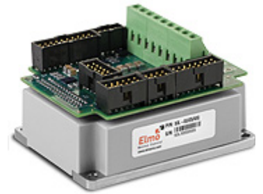
Solo Guitar Intelligent Digital Servo Drive

Two SOL-GUI-35/60s were chosen to be installed in the mobile robot.